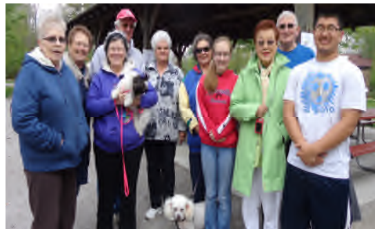
Some of the walkers that came.