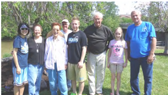
Some that came to help clean up the garden.