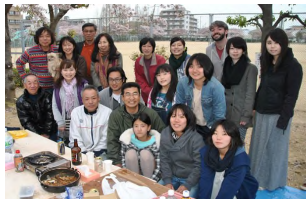
Sukiyaki Party in Akashi