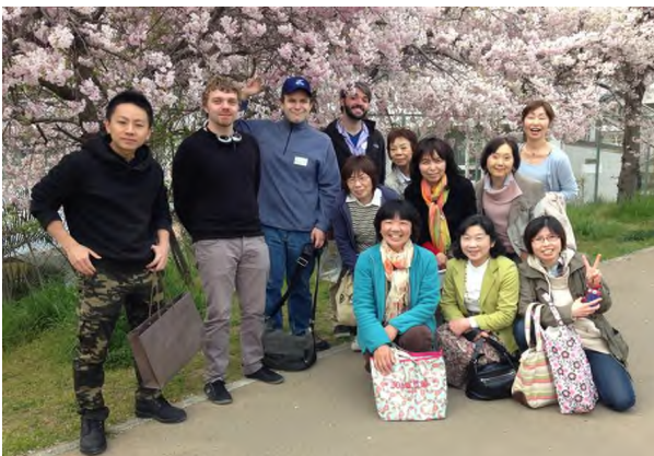
After the Welcome Party